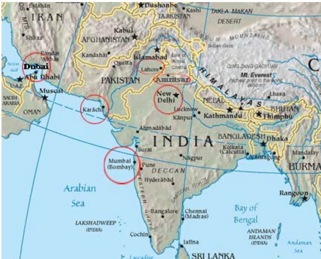
Graph 3: Major Transportation Routes

Note: Edited map to highlight relevant sea and land routes.